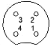
4 pin Mic Plug

This Table shows the Kenwood hook-up points with ref. to drawings.