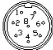
8 Pin Mic Plug